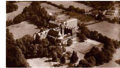
Manor House UK for (Birth Place of Mill Hill Missionaries 1866)