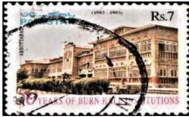
(Postage stamp issued in 1993 on Golden Jubilee Celebration)